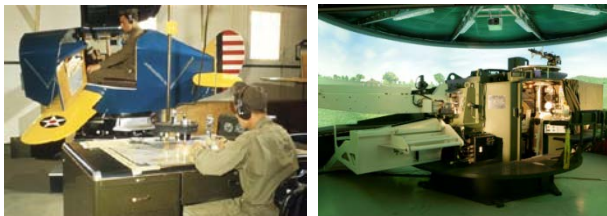
Figure 1 - Link Flight Trainer circa 1943 and KMW Tank Turret Trainer circa 2005 [9].

The earliest computer-generated simulations were often single platform/vehicle simulators, e.g. cockpit trainers and tank turret mock-ups.