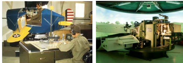
Figure 2 - Link Flight Trainer circa 1943 and KMW Tank Turret Trainer circa 2005 (Lowood, 2003 & KMW, 2014).

The earliest computer-generated simulations were often single platform/vehicle simulators, e.g. cockpit trainers and tank turret mock-ups.