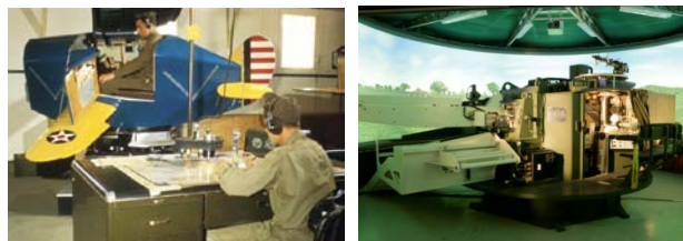
Figure 2 - Link Flight Trainer circa 1943 and KMW Tank Turret Trainer circa 2005 (Lowood, 2003 & KMW, 2014).

The earliest computer-generated simulations were often single platform/vehicle simulators, e.g. cockpit trainers and tank turret mock-ups.