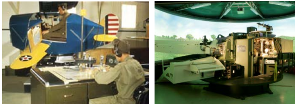
Figure 1 - Link Flight Trainer circa 1943 and KMW Tank Turret Trainer circa 2005 [9].

The earliest computer-generated simulations were often single platform/vehicle simulators, e.g. cockpit trainers and tank turret mock-ups.