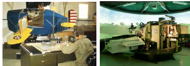
Figure 1 - Link Flight Trainer circa 1943 and KMW Tank Turret Trainer circa 2005 [9].

The earliest computer-generated simulations were often single platform/vehicle simulators, e.g. cockpit trainers and tank turret mock-ups and were used primarily for training, but occasionally were used for evaluation of both equipment and personnel readiness.