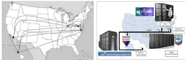
Figure 1 - Advanced Broad Bandwidth Communications Network for Joint Urban Ops and HPCMP Linux Cluster Meta-Computing for JFCOM Urban Resolve Experiments [4]

The authors were all engaged in teams that implemented high-performance computing [2] and communications [3] to enable expanded and enhanced modeling and simulations capabilities.